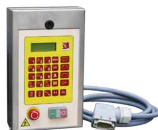
automatics AV on a cable