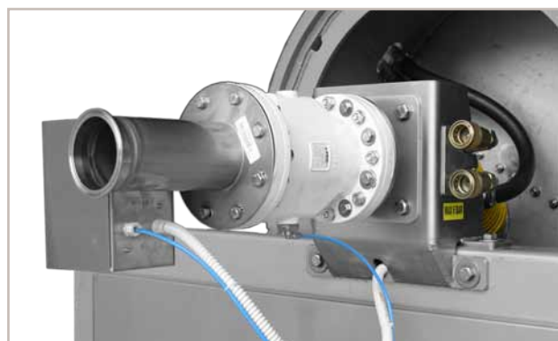
overfilling signalisation, axial filling valve, cooling jacket connections